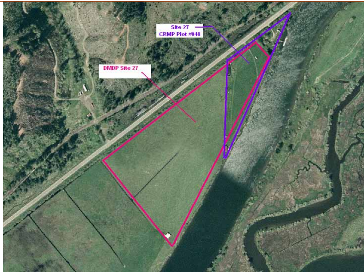
2004 aerial with site boundaries

CRMP Combining Zone: Natural Resource Conservation /NRC (M.U. 13)